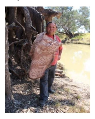
Figure 8: L. Riley, 'Larry's Condobolin Cloak' (2014)

Larry's Condobolin Cloak (Figure 8) represents the Wiradjuri people around the Condobolin area, central New South Wales. The centre of the cloak has the Calare River - at Condobolin, New South Wales - running across the cloak. Beneath this are the two main areas of land on which the local Aboriginal people were forced to reside with encroaching colonialism - the Condobolin Aboriginal Reserve and Willow Bend Communities. The Reserve is represented by the large three concentric circles (inside one another) the pattern/symbols within these circles represents land, to remind us this was and will always be the land of the Wiradjuri. Further to the right are a collection of three smaller concentric circles, these represent the Aboriginal people of Willow Bend and the small footprints around these are the children who went between both settlements to spend time with their grandparents, aunts, uncles and cousins as they have done for millennia spending time with these other parents, brothers and sisters was expected.