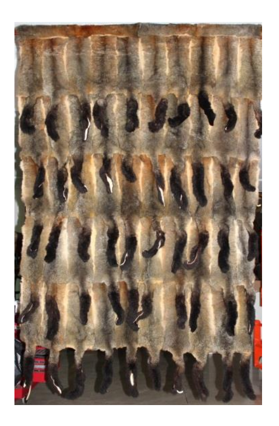
Figure 10: Dhaga Ngiyanhi Ngan.Girra.

1. Four Rivers - flow through the skin panels: Macquarie, Talbragar, Bogan, and Castlereagh – as major rivers across our Traditional Country: Macquarie River - Panels: 3, 4, 12, 13, 21; Totem represented is the "sandpiper" Talbragar River - Panels: 7, 8, 18, 19, 30; Totem represented is the "possum" Bogan River -- Panels: 21, 32, 33, 43, 44; Totem represented is the "mudlark' Castlereagh River -- Panels: 30, 39, 38, 48, 47; Totem represented is "sacred water holes"