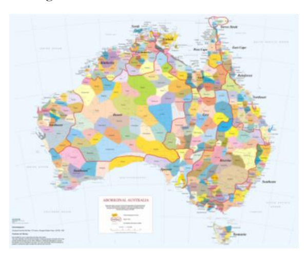
Figure 2: The AIATSIS Map of Indigenous Australia, Horton (1996)<sup>2</sup>

The Australian Institute of Aboriginal and Torres Strait Islander Studies (AIATSIS) Map of Indigenous Australia (Figure 2) shows the diversity of Aboriginal Nations across Australia. The Wiradjuri and Gamilaroi Nations are two of the largest Nations in south-eastern Australia.