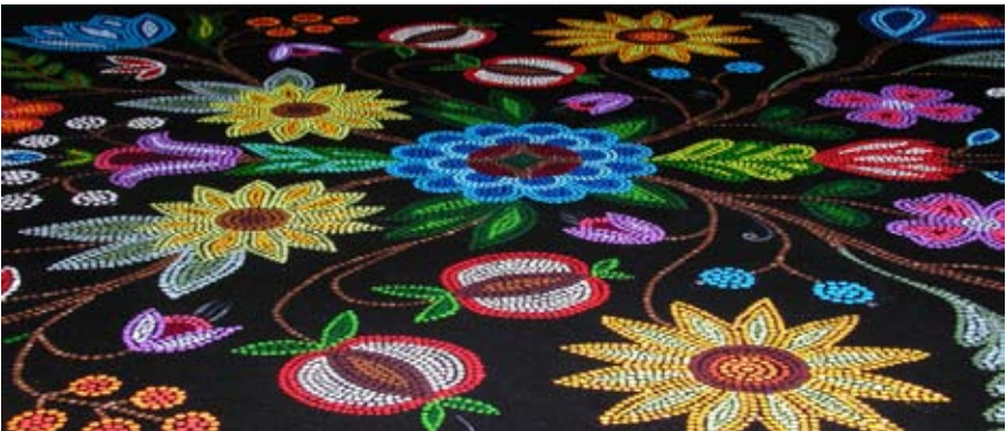
Artwork by Christi Belcourt.