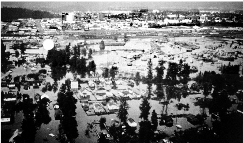
Figure 14: Mid-June Flood — 1972.

... before the flood ... they were dyking. People were just working hard dyking the river. They were ... sandbagging and sandbagging ... ( Int: We found out that the water ... doesn't just come up over the edge. It comes up underneath the ground ... it comes up through the bottom ). That's why the sandbag didn't help. Yeah, well, we didn't know that. [laugh] Everybody just worked side by side. (Rose Bortolon née Cunningham, Cache Resident 1969-1972)