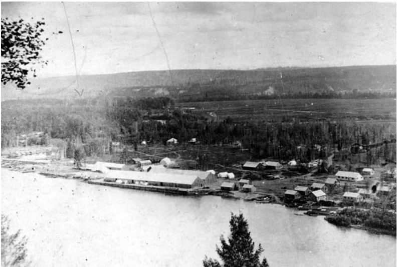
Figure 1: Foley's Cache 1913.

The Island Cache was a small, unincorporated community at the meeting of the Nechako and Fraser Rivers. The place name is actually an amalgam of two previously distinct places. Foley's Cache, an equipment depot associated with the construction of the Grand Trunk Pacific Railway (see Leonard 1996), is the source of the "Cache" part of the name. An island at the mouth of the Nechako, which was later named Cottonwood Island, contributed the 'Island' portion. In 1998, a number of people got together to launch "The Island Cache Recovery Project." The Project was community-centered and participatory. It was guided by an advisory committee consisting of former