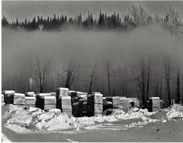
Figure 6: Air Pollution in the Cache — 1972.

the outskirts of the city at the time (see Parker 1965), the housing stock was varied, and a great deal was sub-standard. The community was a relatively poor place, filled with working class families, families on welfare, and families of the working poor. In the 1960s and 1970s, these people were mostly also either Aboriginal or the most recently arrived immigrants from Europe. Only a small proportion of the community was made up of established European Canadian immigrants — those who were “white” were mostly poor.