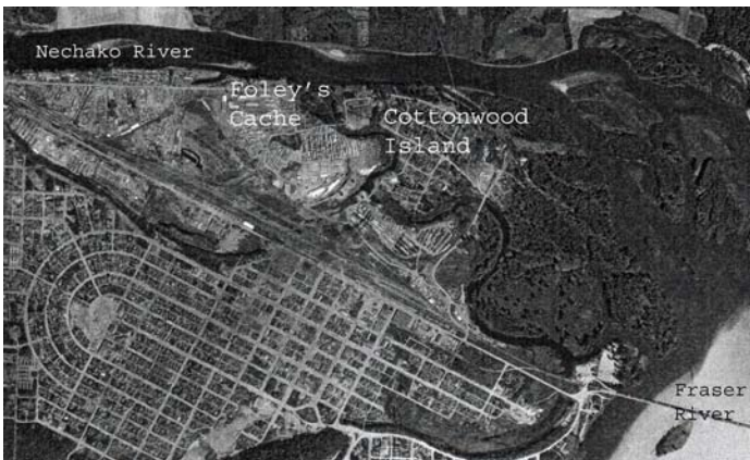
Figure 2: The Nechako Fraser Junction 1955.