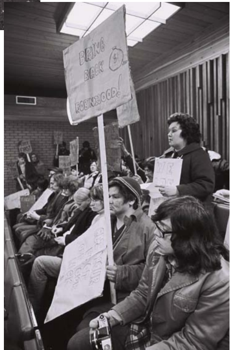
Figure 10: Poor People's Protest in City Council Chambers — 1971.

Life of the Island Cache (Evans et al. under review). A description of one episode will have to serve as an example. After annexation in May of 1970, residents appealed to the city to improve flood protection measures for the community. After a great deal of foot dragging, the city agreed to only half measures, electing to raise the perimeter road (River Road) at a cost of $1500, rather than the dyke itself at $4200. In response residents organized "Operation Sandbag" or "Up the Dyke Day."