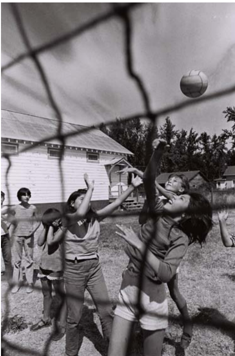
Figure 8: Kids Playing Volley Ball at Island Cache School — July 1970.

This is not the place to go into all the ins and outs of what happened. A great more detail is forthcoming in a monograph entitled A Brief History of the Short