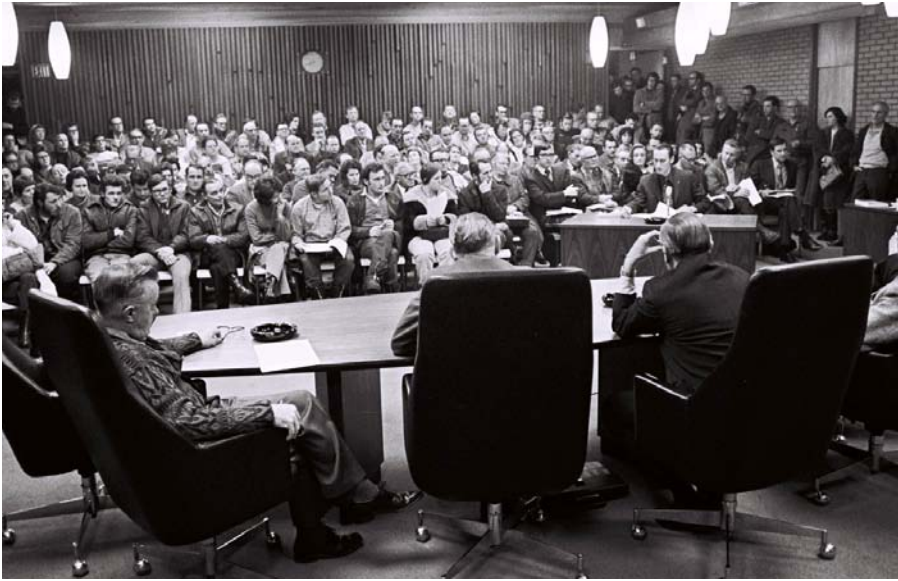
Figure 11: “Crowd In” Protest at City Hall — Winter 1972.