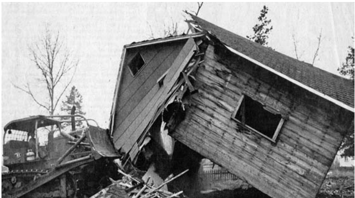
Figure 16: Bulldozer Demolishes Home — 1972.

By mid-June, most of the Island Cache was under water. This was the excuse the city needed. Like the water from the river, the power of the city began to seep under the political dykes the community had built. Using health and building inspectors to condemn buildings, over the next six months the city was able to bulldoze and burn the vast majority of the homes in the community.