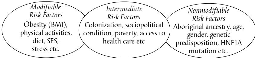
Figure 2: Modifiable, Intermediate, and Nonmodifiable Risk Factors of Diabetes among Aboriginal Peoples

they are beyond the control of Aboriginal individual, communities, and governments.